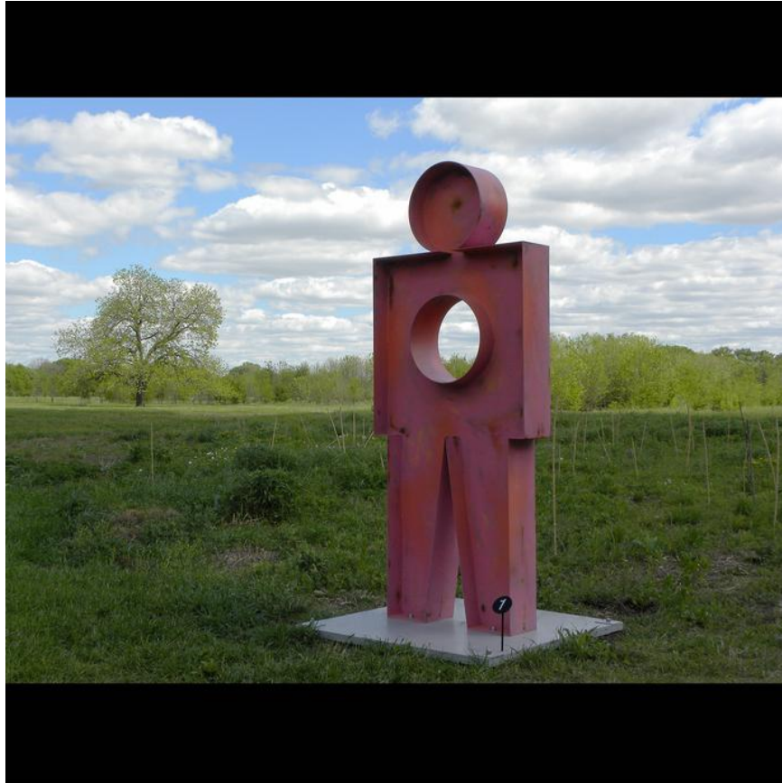
Human Nature, Figure No. 1

The Display Period (Exhibition Dates) for this artwork will be marketed as April 25, 2026- April 9, 2028.