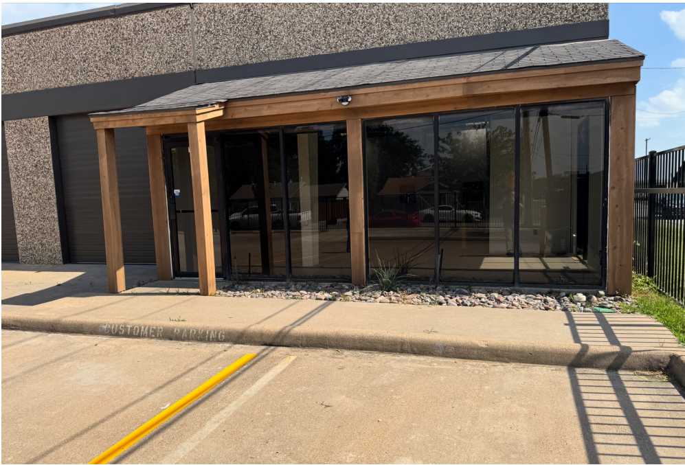
Detail of planter in front of northwest corner. Could add decorative plants to all planters.