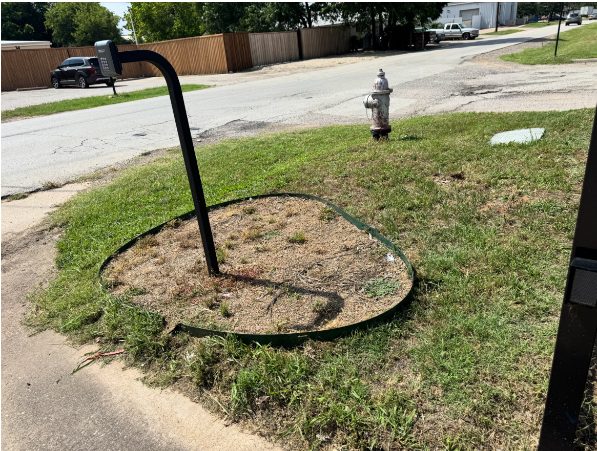
Corner of S. Kealy Avenue and Thomas Street. Could add trees, etc.