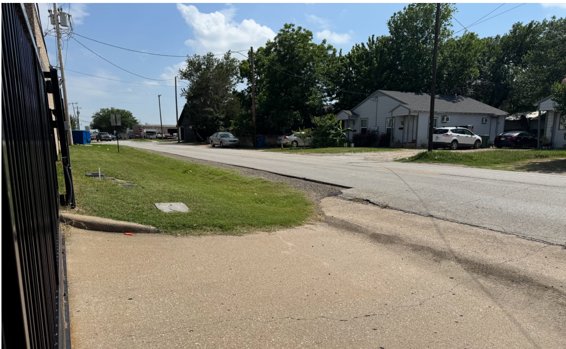
Swale on S. Kealy Street, directly next to the building. Could add trees, etc.