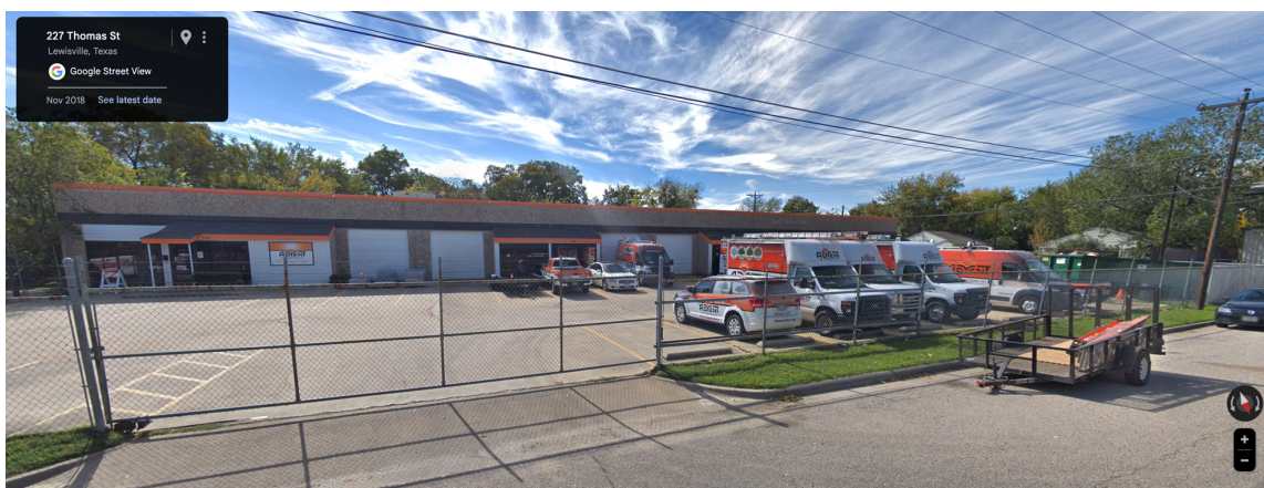
Prior intensive use of 500 S. Kealy Avenue in November 2018, by prior owner.