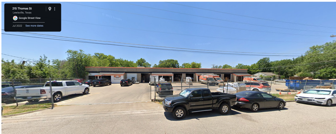
Prior intensive use of 500 S. Kealy Avenue in July 2022, by prior owner.