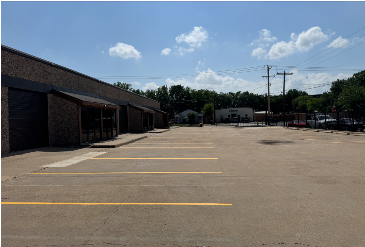
Current exterior of 500 S. Kealy Avenue, Lewisville, Texas.