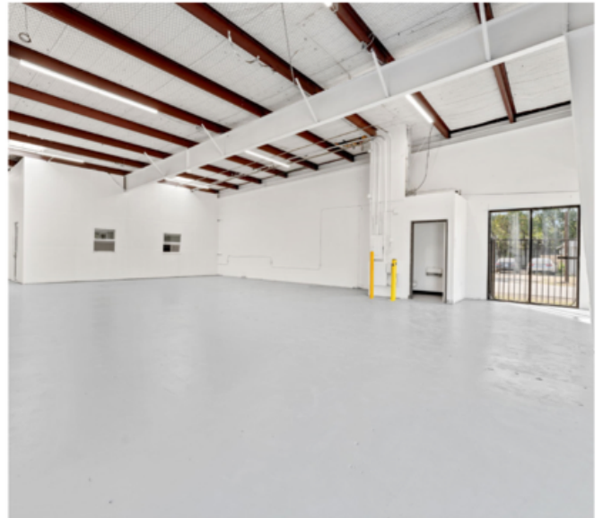
Interior of administrative / office areas, and warehouse area which will be used for van parking, and warehousing.