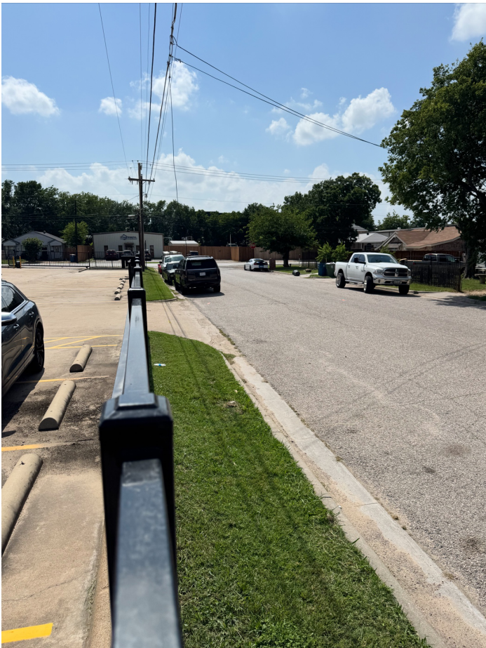
Front grass strip along Thomas Street. Could add trees, etc.