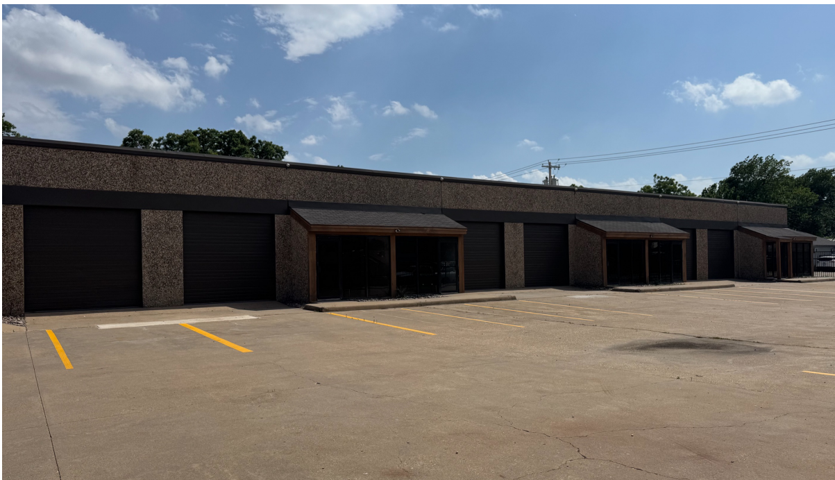
Current exterior of 500 S. Kealy Avenue, Lewisville, Texas. All of the large windows (under the angled roofs) have built-in planters with sprinklers, currently planted with low water consumption succulents and decorative stones at ground level.