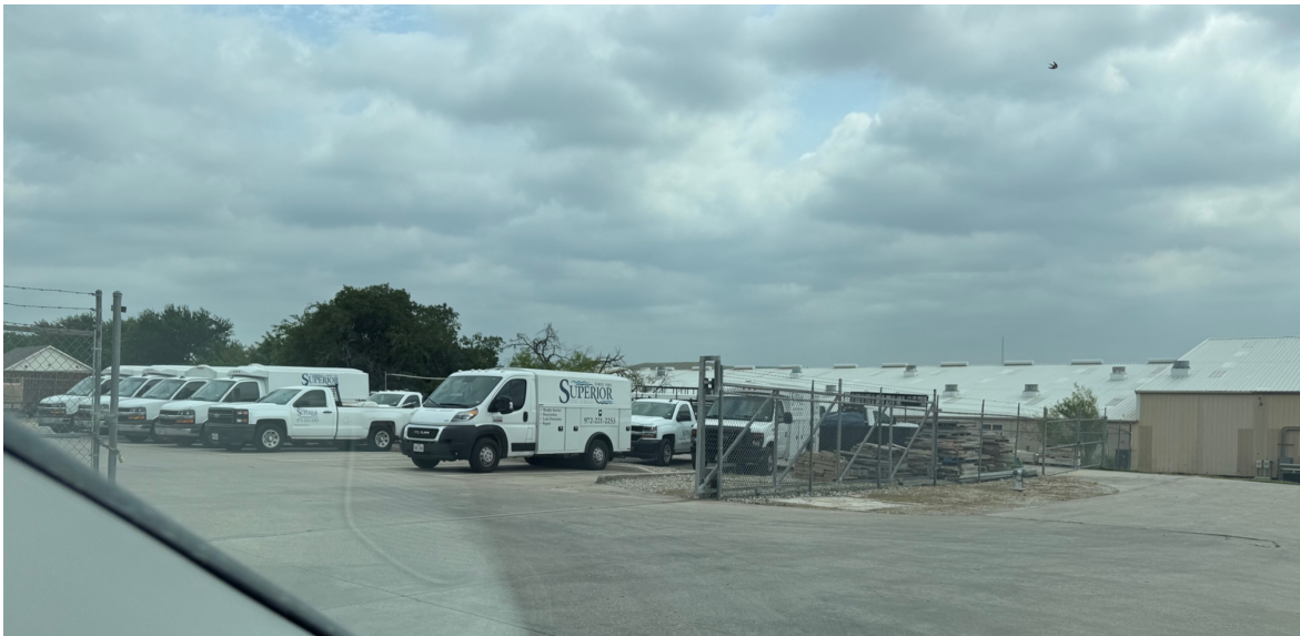
Current intensive use at Superior Pools.