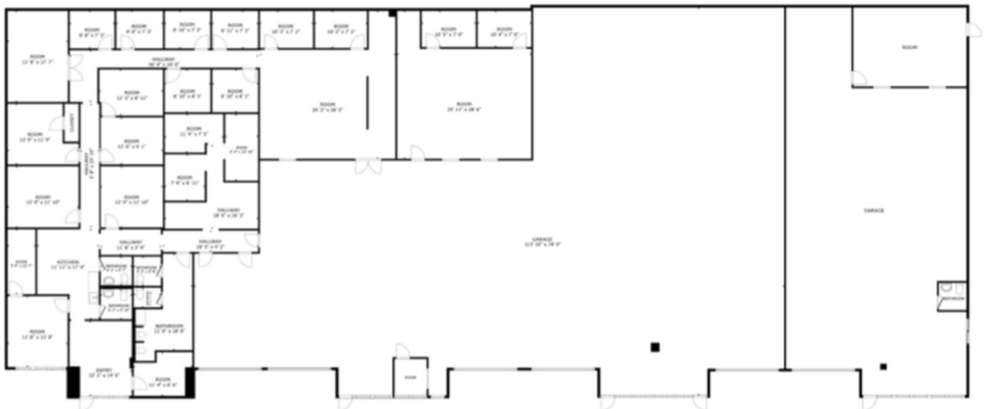
Interior floor plan of 500 S. Kealy Avenue, Lewisville, TX. We will be removing the non-structural partition wall between the two warehouse areas on the right side.