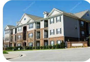
Hotels / Apartments