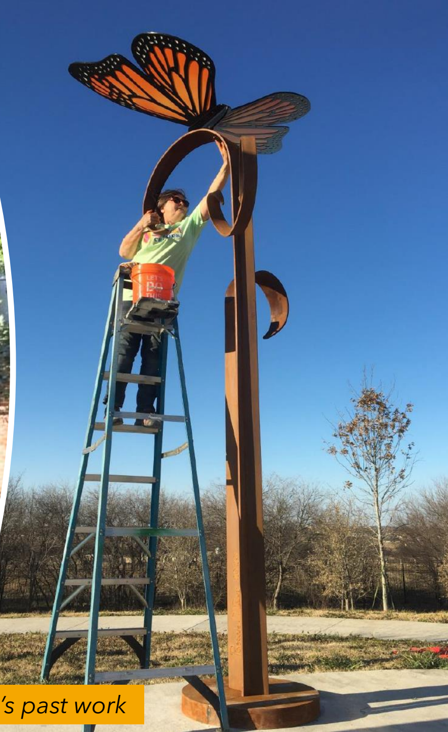
Examples of Pascale's past work