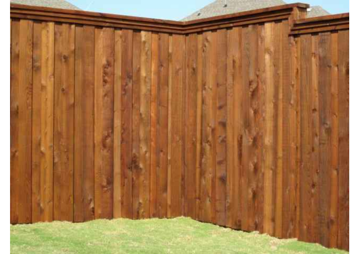
8 FT PRIVACY FENCE

PROPOSED 8 FT BOARD ON BOARD PRIVACY FENCE WITH 26 FT GATE AT DRIVE ENTRANCE