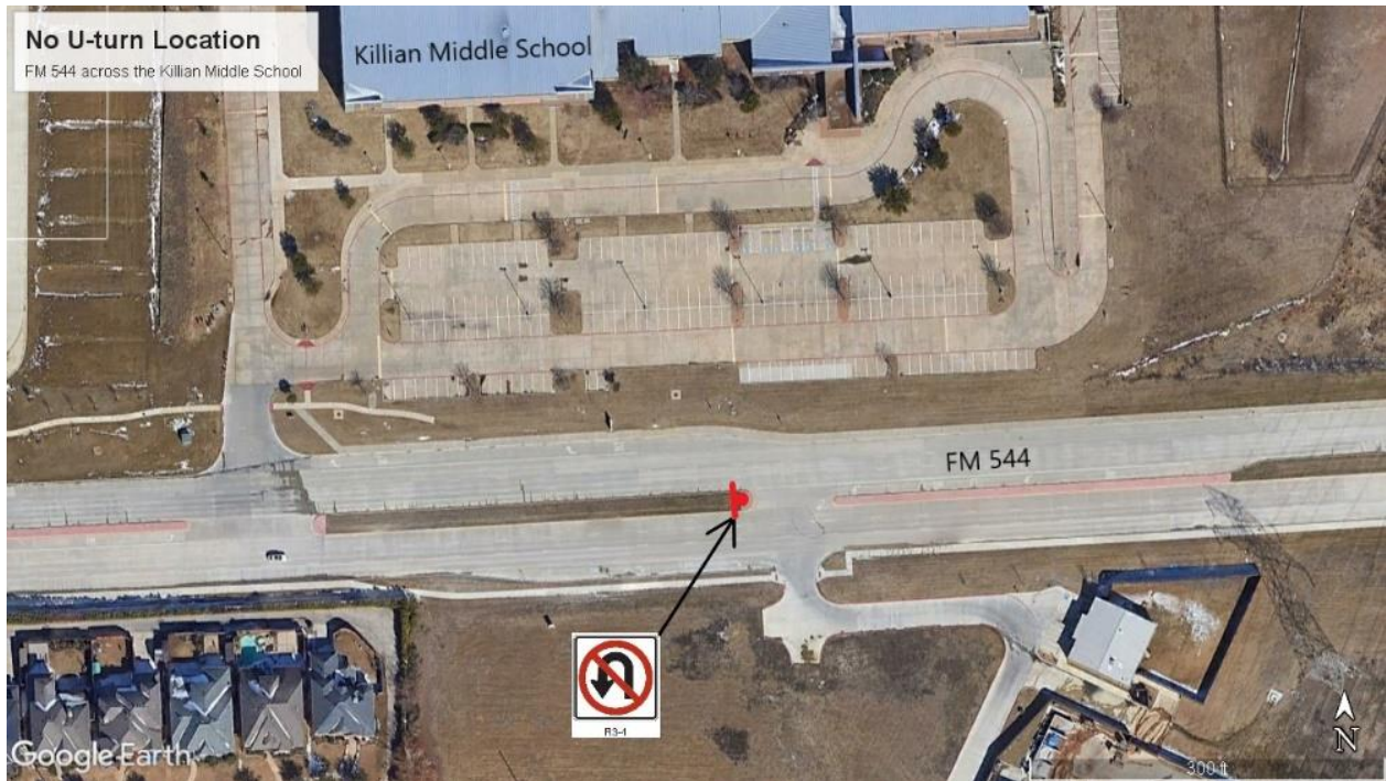
Figure 2: Proposed 'No U-Turn' sign location on FM 544 across the Killian Middle School

West Vista Ridge Mall Drive at Highview Lane intersection: Trucks and trailers from the concrete batch plant on W Vista Ridge Mall Dr make U-turns at this intersection to shortcut their path to SH 121 BUS. There is no east bound left turn bay at the median opening and the road is too narrow for the trucks to make a U-turn. Trucks are required to make a few back and forth movements to make the turn and block the road in the process before being able to make the U-turn. Staff recommends prohibiting eastbound U-turns at the subject intersection and the installation of a 'No U-Turn' sign per Figure 3.