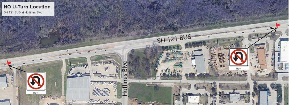
Figure 1: Proposed 'No U-Turn' sign locations on SH 121 BUS

FM 544 across the Killian Middle School: The speed limit on FM 544 is 55 mph. On east bound FM 544, there is a median opening with a left turn bay for entering to the school driveway. At the school drop off times, some vehicles trying to avoid the queue in this median opening turn bay and take the median opening downstream to make a U-turn and enter the school driveway from the east direction. The second median opening, approximately 480 ft. east of the Killian Middle School Entrance is designed for westbound vehicles turning left and does not have a left turn bay for eastbound vehicles. U-turns in this median opening bring the left lane to a stop and is dangerous. In addition, it creates conflict for the westbound traffic as often the queue in the Killian Middle School driveway right turn lane backs up past the subject median opening causing u-turning vehicles to cut into the queue. Staff recommends prohibiting eastbound U-turns at the median opening approximately 480 ft. east of the Killian Middle School Entrance and the installation of a 'No U-Turn' sign per Figure 2.