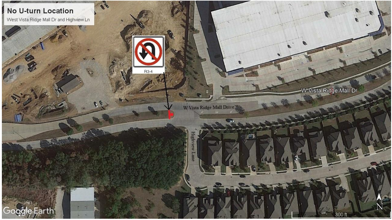
Figure 3: Proposed no 'No U-Turn' sign location on W Vista Ridge Mall Dr.