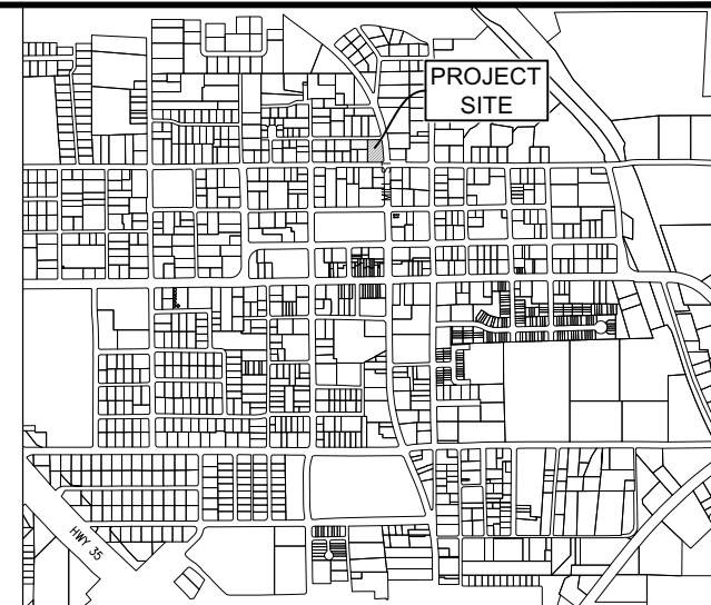
Vicinity Map 1"=1000'

LEGAL DESCRIPTION 1.141 Acres J.W. King Survey, Abstract No. 696 City of Lewisville Denton County, Texas