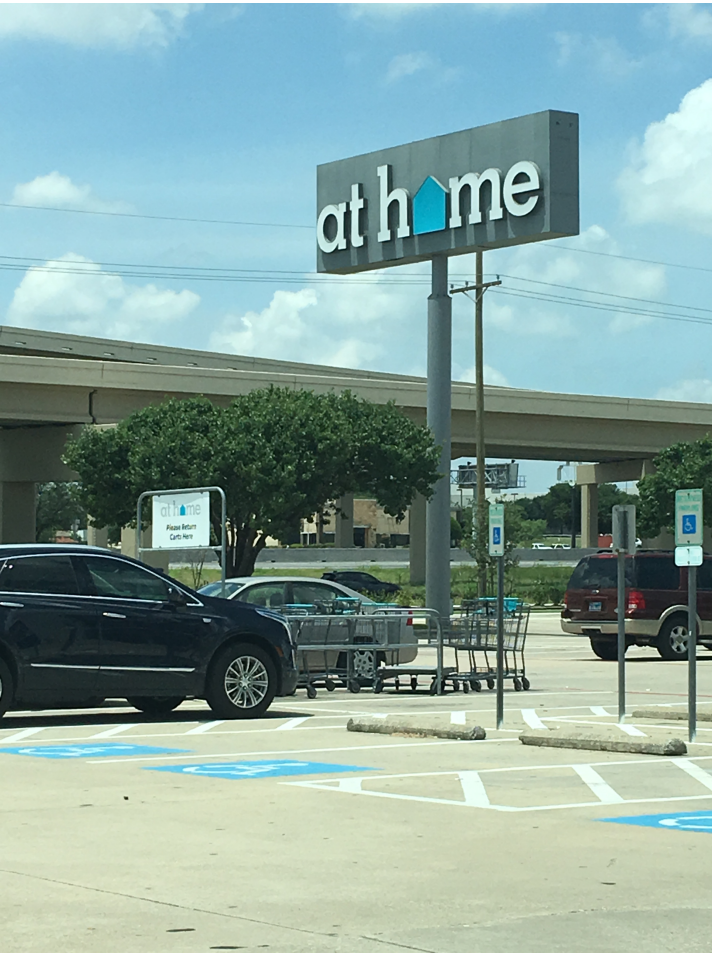
EXISTING POLE SIGN 40' ABOVE GRADE SIGN FACE 300 SF