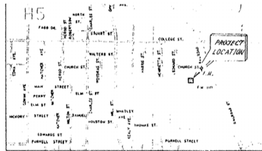
VICINITY MAP SCALE 1"=1000'