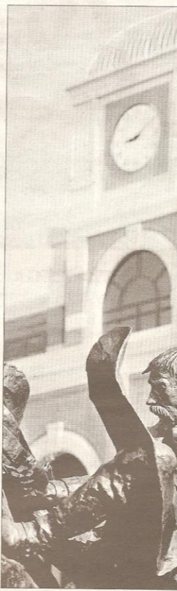
Slicker Shy stands in front of Lewisville around the corner," councilman Lathan